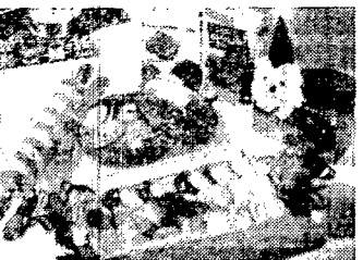
GIVE HOMEWIFE COOKIES - Bake a batch of these dainties using our easy recipe cards. Wrap in handsome tins.