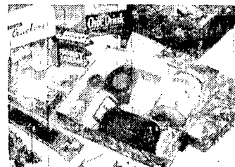
MIDNIGHT RAIDER GIFT - Crackers, cheese, salami, instant choc. mix... just a few of the snacks to please readers.